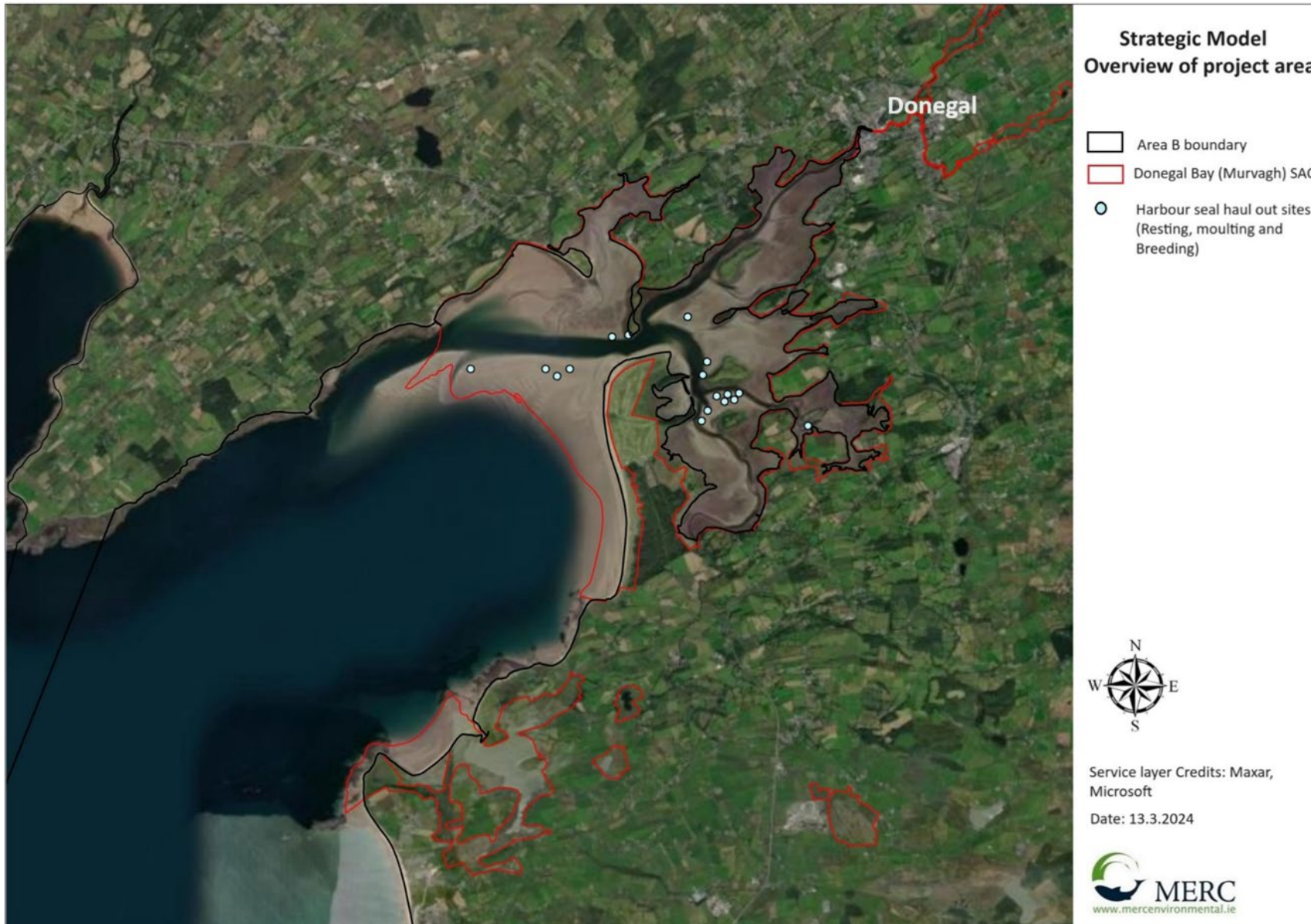
Figure 2. Area B. Harbour seal haul out sites.