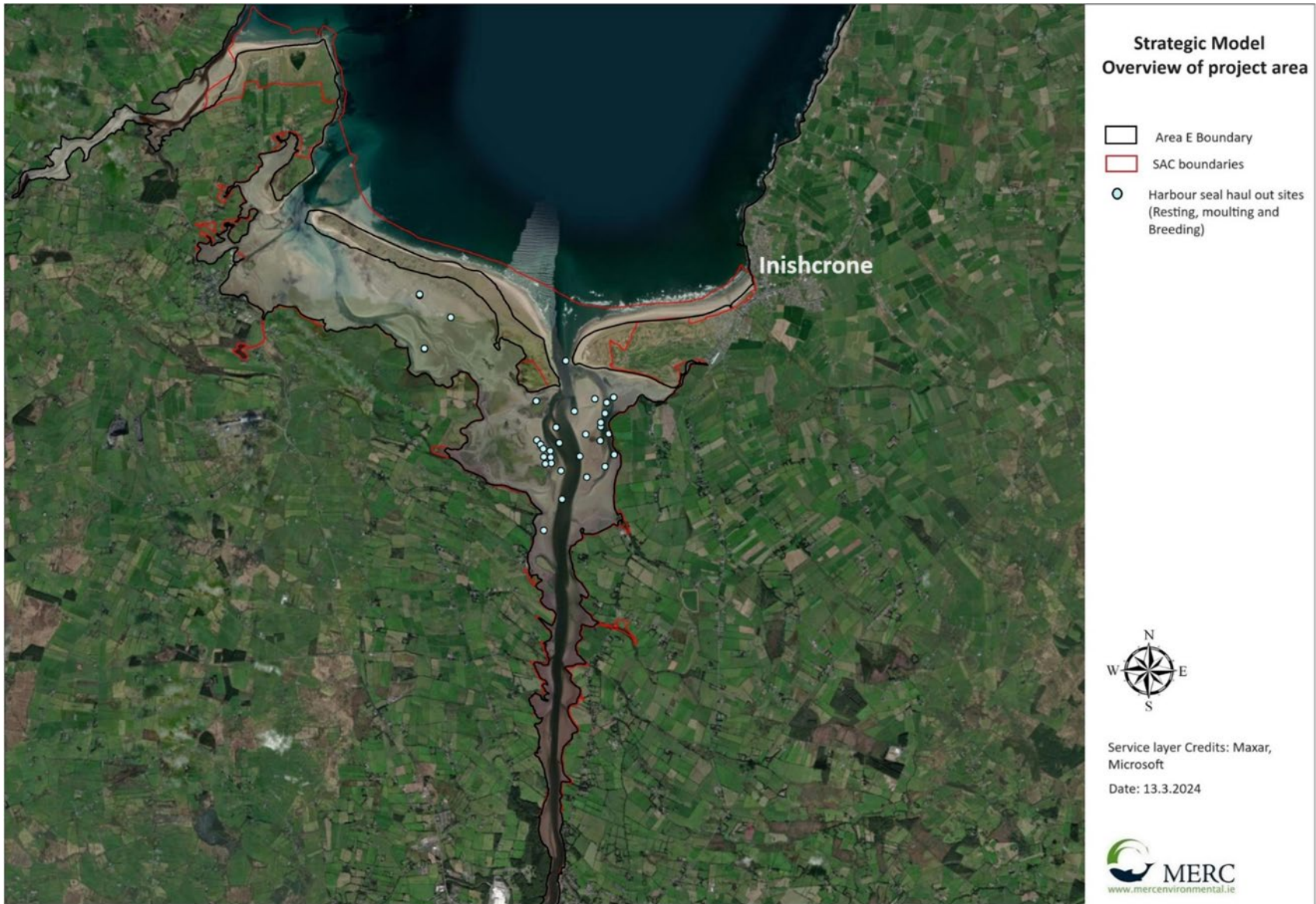
Figure 4. Area E Harbour seal haul out sites.