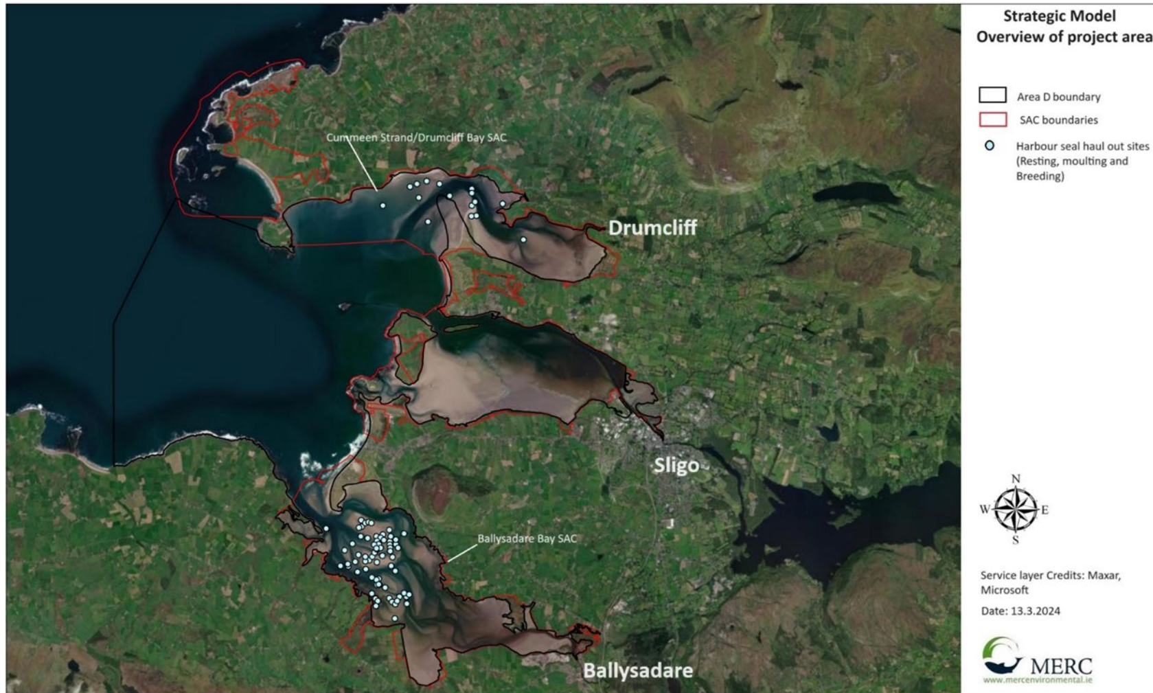
Figure 3. Area D Harbour seal haul out sites.