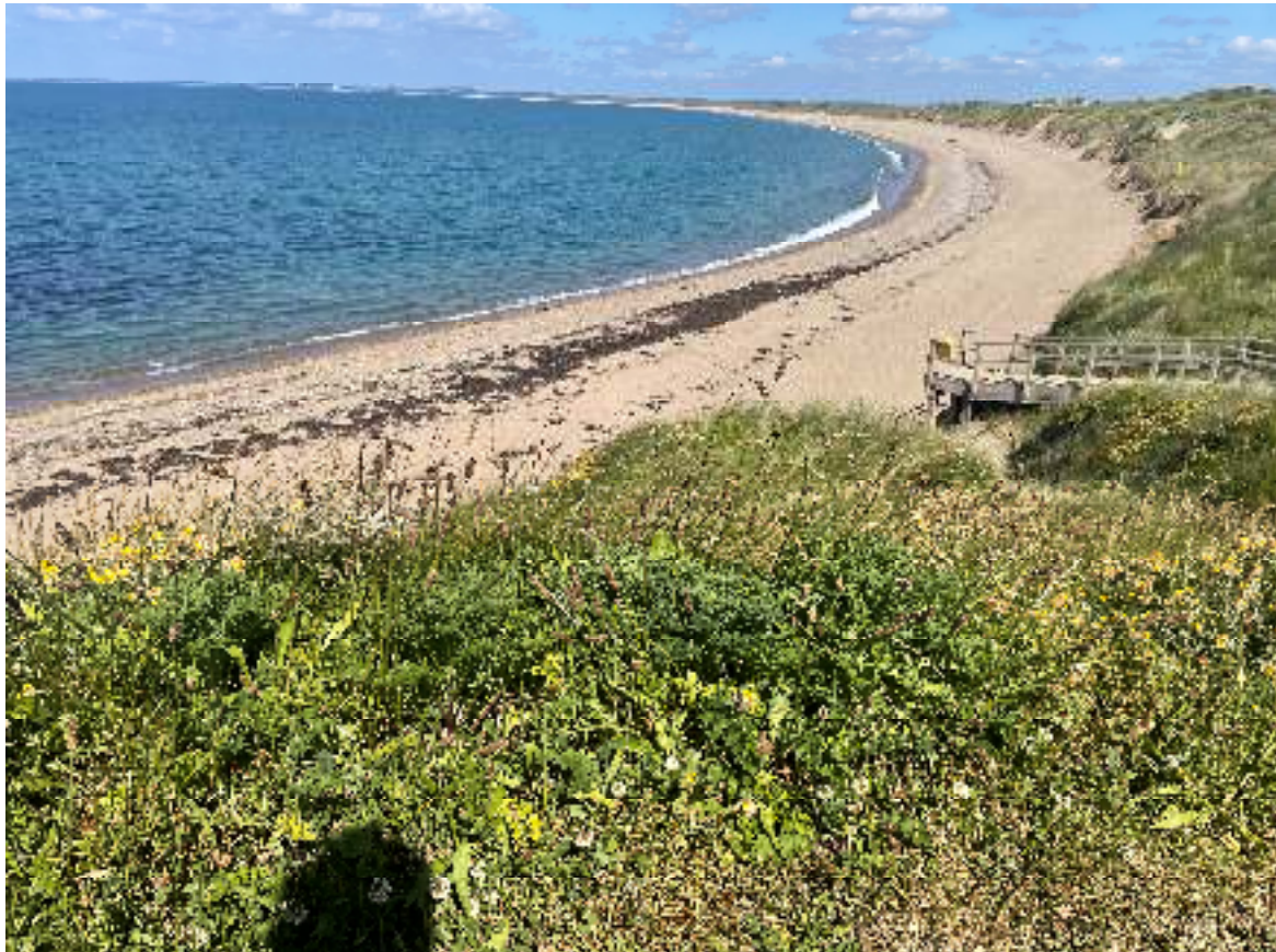
Landfall at Crossfarnogue Beach, Kilmore Quay, County Wexford

I inspected the proposed landfall sites on 12/06/2024. The site is a public beach which is popular with bathers and walkers during the summer season. Accordingly, it is important that during the course of the intertidal trial pit and bar probe operations the existing public access arrangements are maintained, where possible, and all necessary precautions are put in place to the public in accordance with relevant Health and Safety Legislation. Subject to Specific Condition 4 below, the site investigation works will not significantly injure the public use of, access to or enjoyment of the maritime area in question.