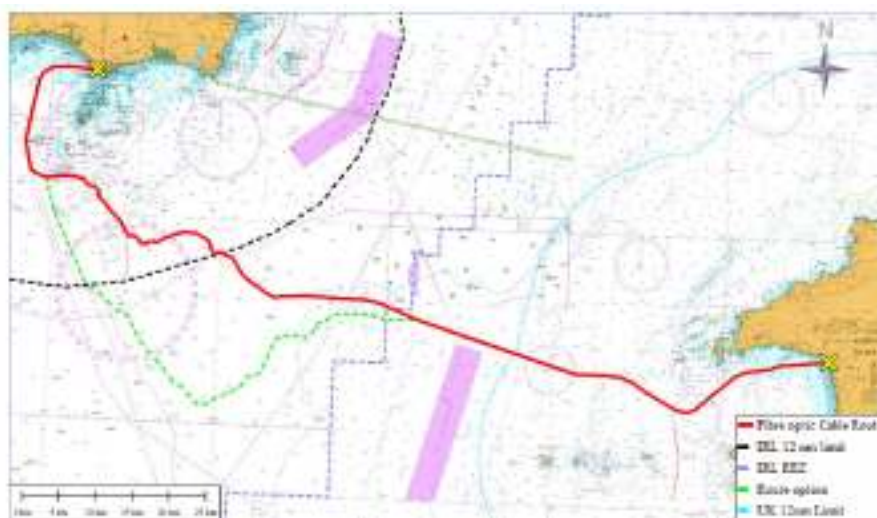
Figure 1. Proposed cable route (AIMU December 2023)

The proposed SI works will take place between the HWM and the Maritime Boundary with the UK in the Irish Sea. A cable route corridor of approx. 400-1500m width will be surveyed within the Licence Area. The site boundary for all proposed SI works is shown below in in Figure 1. The licensed survey corridor has length of approx. 154 km and a total area of 10,191 hectares within EEZ limits.