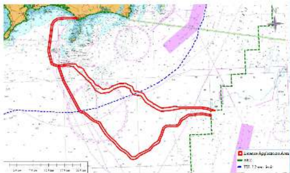
Proposed Survey Area

3 No trial pits. 2.5m depth. Location: Between LWM and upper beach at Crossfarnogue Beach. Locations as indicated on 1359-A-104 Site Layout Map 3 and may vary.