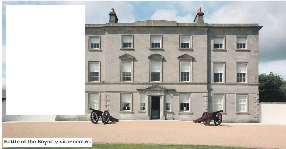
Battle of the Boyne visitor centre.